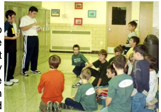
The Junior boys hear a lesson about Loyalty from one of the Seniors.

class with a service project. They removed 20 cut logs and rakes a huge pile of leaves along with other yard work in the neighborhood.